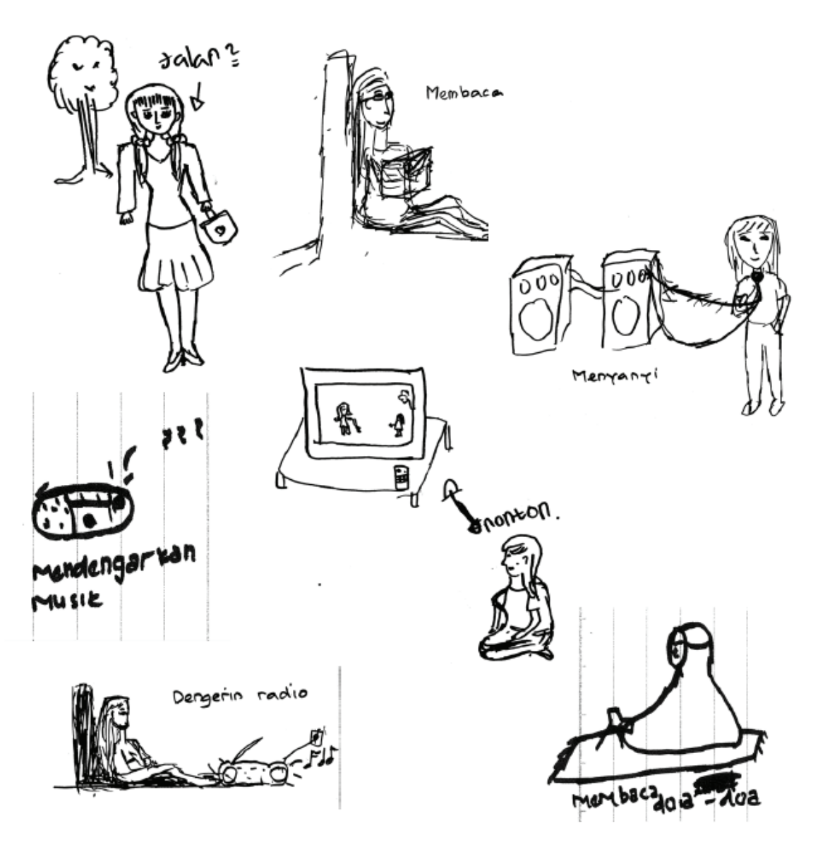
When we asked some girl domestic workers to draw for us the kind of activities they like to do when they have free time, they illustrated reading, going for walks, praying, listening to music, watching television, and singing karaoke.

One domestic worker recruitment and placement agent, who we telephoned anonymously as if we were interested in hiring a domestic worker, told us that it was acceptable to forbid a domestic worker from leaving the home, and informed us that the agency's contracts stated that domestic workers were not allowed to leave the employer's house without the employer's permission. When we telephoned another agency, this time under the pretence