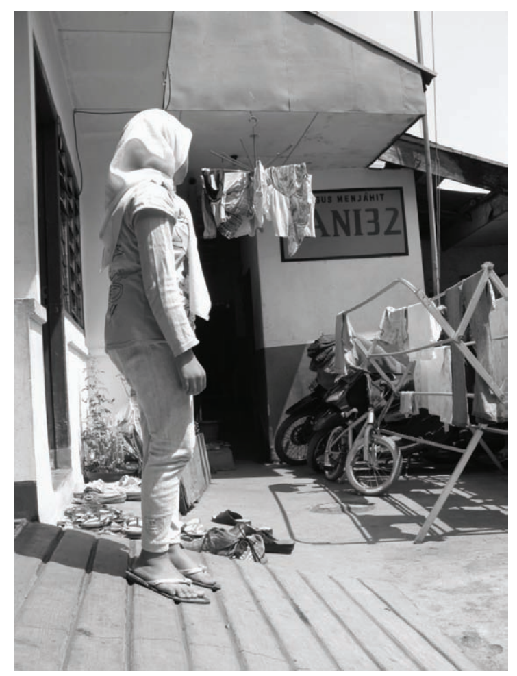
Many girls begin work younger than allowed by Indonesian Law. This girl, who is 13 years old, began working when she was 11 years old.

Regardless of the exact inspection regime, research conducted by Human Rights Watch around the world indicates that strengthening workers' associations, labor resource centers, children's drop-in centers, and devising accessible complaint mechanisms can play an important role.