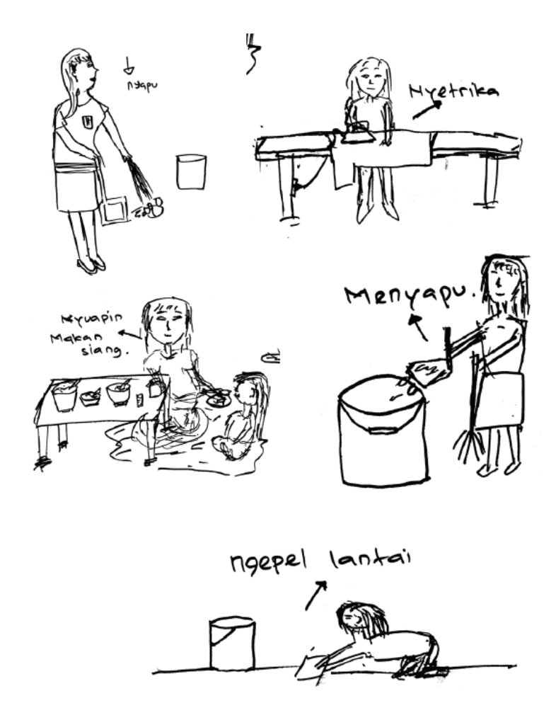
When we asked some girl domestic workers to draw for us the kind of tasks they have to do every day, they illustrated activities such as ironing, cleaning the floors, laundry, and child care.