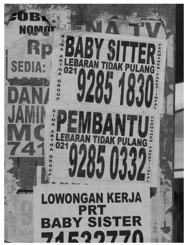
This labor placement agency uses the fact that its domestic workers do not go home for the Eid-ul-Fitr holiday as a marketing point.

To the extent that policymakers believe that domestic work or child care is a necessity to enable others to engage in work outside the home then the government needs to consider pursuing alternative policies that do not depend on the exploitation and under payment of child workers. For example, other alternatives might include the creation of accessible, affordable child care options for families, making workplaces more flexible for working parents, or providing for more generous maternity and paternity leave.