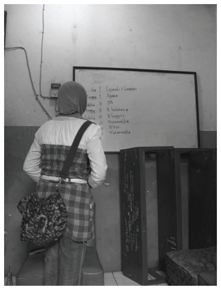
This 17-year-old domestic worker is a rare exception in that she is able to attend a few hours of informal schooling one day each week.

When we put this proposition to the head of one of the largest domestic worker recruitment and placement agencies in Jakarta, he told us simply, "100 percent of my girls are treated as employees and not as family members." His agency places more than 1,000 individuals into domestic jobs each year and about 80 percent of these placements are women and girls under age 20. He said, "[Whenever] politicians say this it is just their way to isolate the truth and pretend that [exploitation] does not exist, when in reality [domestic workers] are treated like slaves." <sup>83</sup>