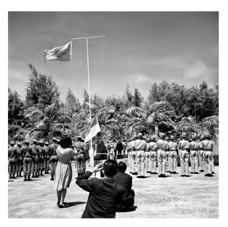
The UN and Indonesian flags are raised side by side at a ceremony in December 1962, held at the residence of the UNTEA Administrator in Hollandia (now Jayapura), Papua.

would maintain a ceasefire between Indonesian and Dutch forces, assist the Papua police to maintain order, and transfer authority to Indonesia by May 1963.