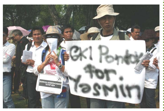
People's protest against the closure of the Yasmin church in Bogor, source: KontraS

While the construction was in progress, the head of the Bogor city planning and landscape department (Kepala Dinas Tata Kota dan Pertamanan Bogor) issued a letter on February 14, 2008, requiring the halting of all construction work. The congregation won an appeal at the Supreme Court on December 9, 2010, allowing construction work to resume.