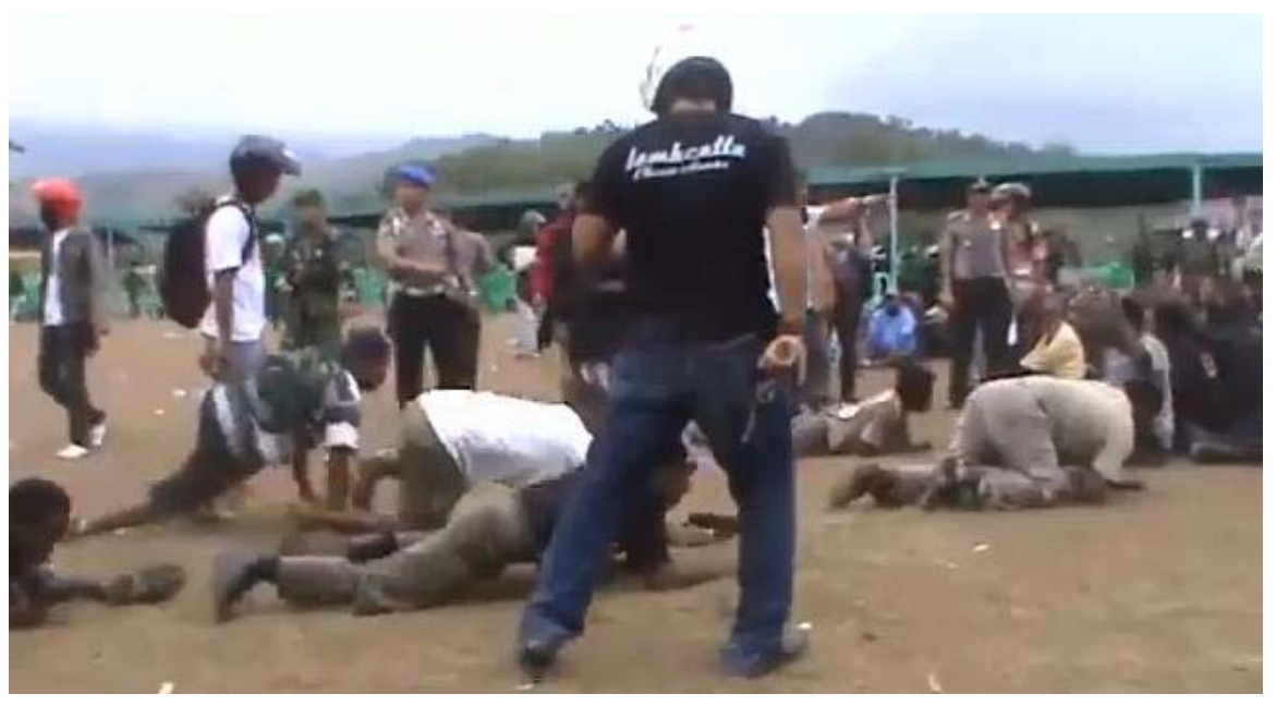
Police and un-uniformed thugs arrest participants of the Third Papuan Congress in October 2011

Indigenous civil society groups are subjected to tight controls and surveillance by the intelligence authorities, the military and police in Papua, including raids on their offices, staff members being intimidated or even arrested, notably after public protests. In particular, peacefully expressed indigenous political demands for greater self-determination or the display of Papuan identity symbols such as flags frequently result in arrest and detention that can range up to life imprisonment, based on charges of sedition