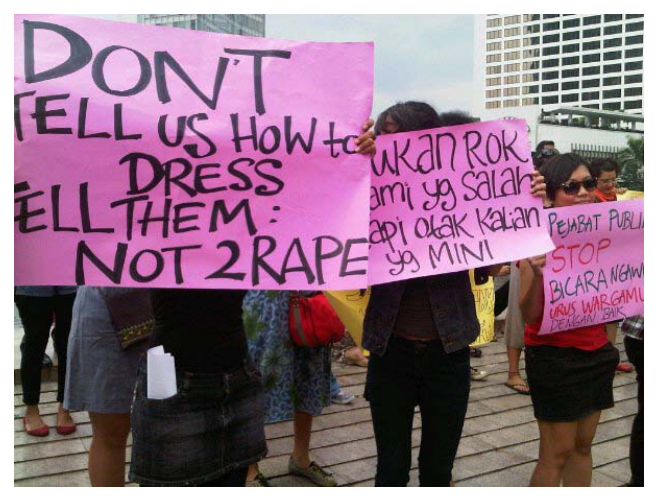
Women protesters at the "Miniskirt Demonstration" in September 2011, source: Lia Marpaung

The GoI has so far not effectively prevented cases of violence against women in Indonesia. Jakarta Governor, Fauzi Bowo even stated that the rape and sexual harassment were the fault of women and that women shouldn't wear miniskirts or hot-pants in public if they don't want to be raped or sexually harassed.