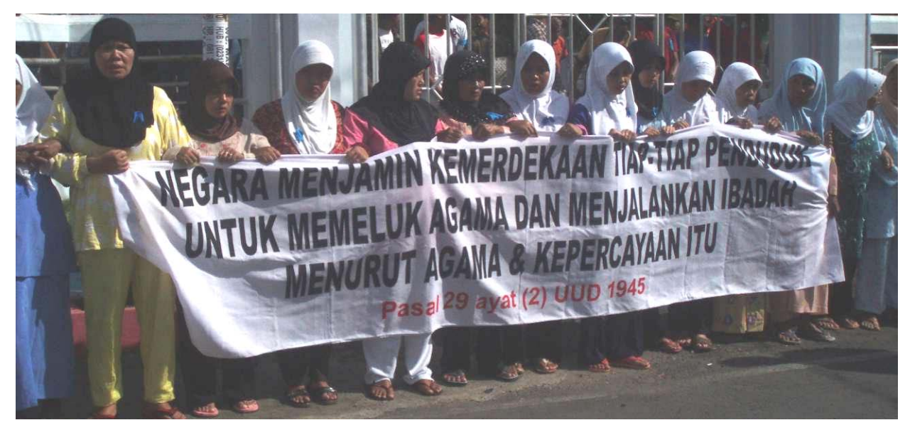
Members of the Ahmadyah community demonstrate for freedom of religion. The banner calls for article 29 of the constitution (freedom of religion and belief) to be respected in the face of attacks against religious minorities

Freedom of religion and belief and the protection of religious minorities are among the most serious emerging human rights issues in Indonesia over recent years, notably in 2011. Law no. 01/pnps/1965 recognises only six main religions in Indonesia: Islam, Christianity, Catholicism, Buddhism, Hinduism and Confucianism. Other religions and beliefs are deprived of legal protection.