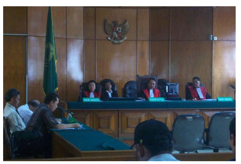
Court reconsiders the case against Pollycarpus at the Jakarta Central District Court

into Munir's case is finished. The AHRC is very concerned about this statement given the list of persons that were allegedly into Munir's involved assassination. but who remain free from prosecution. Terminating an investigation without investigated having all suspects and without any of the instigators having been convicted is tantamount to an obstruction of justice.