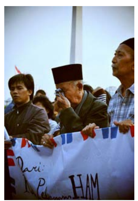
Victim from the 1965 massacre during the submission of a mass letter collection to the president in August 2011 for the occasion of the Indonesian Indendence Day

Komnas HAM, after having formed a team in 2008 and having conducted investigations for more than 3 years, finally announced the conclusion of its work regarding the 1965/1966 case in 2011. A total of 357 victims from several areas in Indonesia have had their cases investigated by the team. The investigation report was not released in July as announced, but has been delayed since then. No time-frame for the release of the report has been provided, and the victims fear further delays will occur preventing their cases from being brought to the human rights court in the near future.