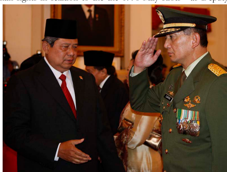
Photo: Appointment of Syafrie Sjamsoeddin by the president as deputy defence minister despite his responsibility for serious cases of gross violations of human rights in the past

Defense Minister<sup>32</sup> in 2010, through Presidential Decree 3/P(Keppres) No. 2010, was heavily criticised. Although victims of past human rights violations and their family members, together with several human rights NGOs in Jakarta, filed a lawsuit to repeal the Presidential Decree at the State administrative court on April 5, 2010, it was rejected on September 6.