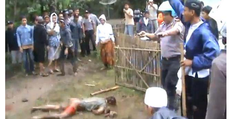
Police is standing between the angry mob who killed three Ahmadiyah followers without having protected the victims

impartiality and undermine minority rights. The AHRC published a statement concerning this case which can be found here: http://www.human rights.asia/news/ah rc-news/AHRC-STM-106-2011