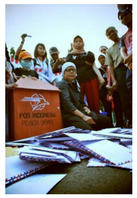
Victims of the 1998 May Riots submitting letters to call for accountability and recognition of the violations they suffered, August 15, 2011, source: KontraS

Despite numerous promises to take effective action concerning impunity, only two cases of gross violations of human rights have been brought