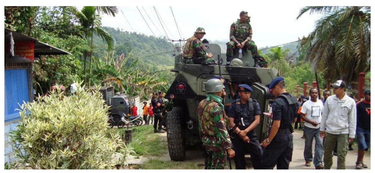
Omnipresent security forces in Papua surround the Third Papuan Congress