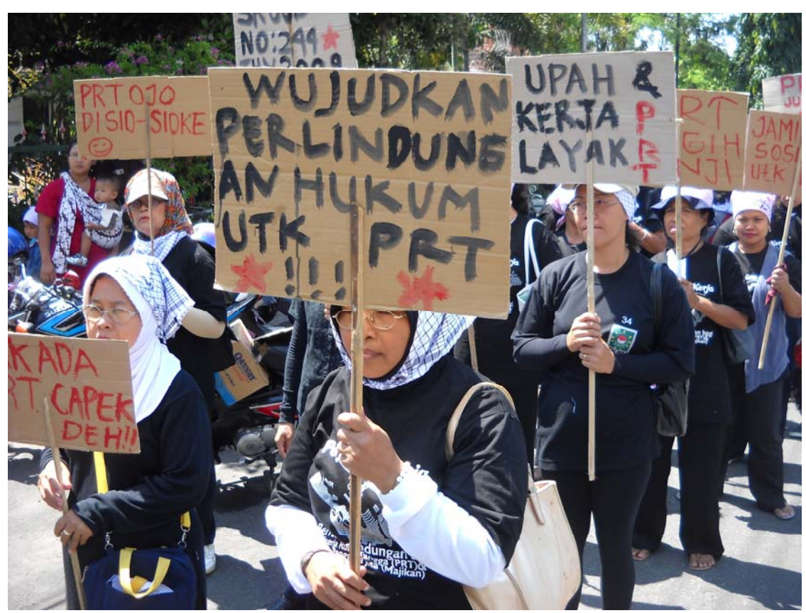
Women domestic workers demonstrating for their rights, including protection under the law, February 2010.

This lack of legal protection for domestic workers is in violation of international human rights law and standards pertaining to workers' rights. In particular, by excluding women and girl domestic workers from legal protection in relation to their gender-specific needs, the state is in violation of its obligations as a state party to CEDAW, <sup>151</sup> CRC, <sup>152</sup> and the ICESCR. <sup>153</sup>