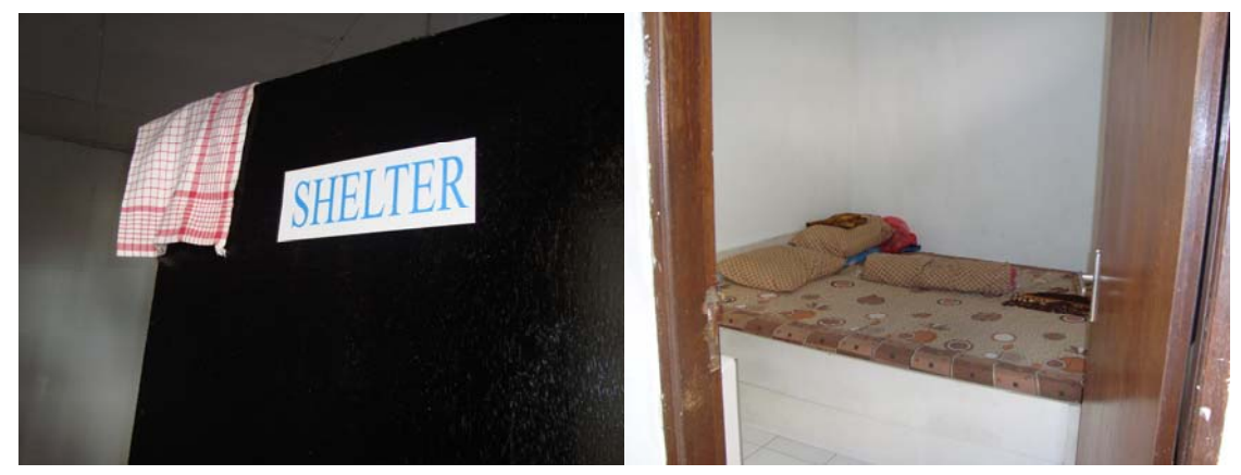
Non-governmental shelter for women and girl victims of abuse, Eastern Indonesia.

When the state fails to ensure rape victims are guaranteed access to health care in practice, it violates women's sexual and reproductive rights; moreover the state is failing in its duty to provide the reparation to which victims are entitled under international human rights law and standards.