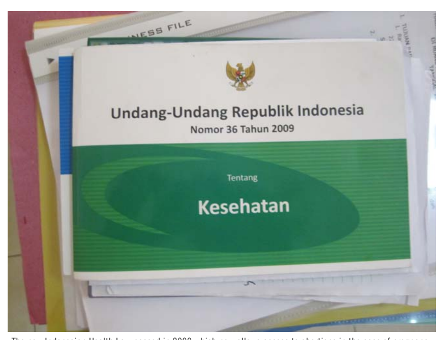
The new Indonesian Health Law passed in 2009 which now allows access to abortions in the case of pregnancy resulting from rape.

"This is the first time I hear about it [the legal provision for rape victims in the 2009 Health Law]" a Jakarta-based doctor who works at a local community health centre, March 2010. 121