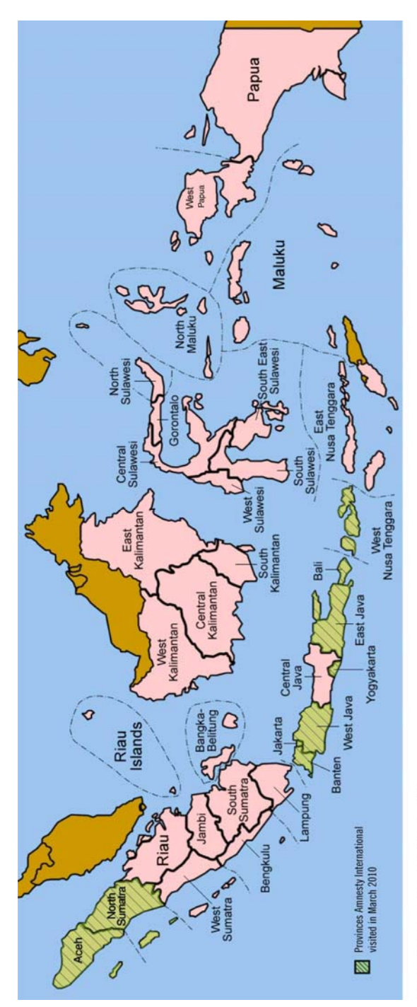
Provinces in Indonesia