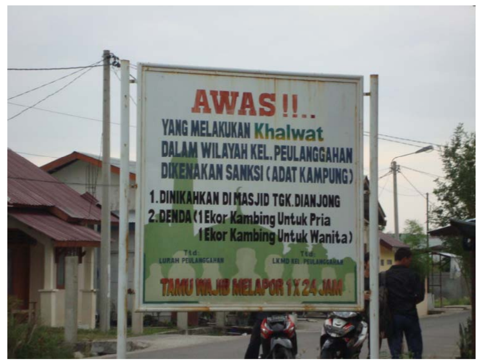
Signpost warning the local community in Aceh that khalwat is prohibited. Khalwat is defined as two unmarried adults of the opposite sex who are not close relatives and who are together without the presence of other people.

Many people misunderstand khalwat , believing that it only criminalizes sexual relations outside marriage when in fact it criminalizes merely being alone with someone of the opposite sex who is not a relative.65 According to the Commission, the application of the bylaw on khalwat has led to "mistaken" arrests and detentions. In some cases, these arrests and detentions have also led to women being forced to admit that they had sexual intercourse with someone who is not their husband. In one case, it led to the long-term exclusion of a woman from her village because she was stigmatized by the community at large as a result of the assumption that she had sex outside marriage.<sup>66</sup>