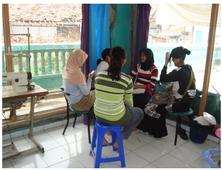
Girl domestic workers between the ages of 13 and 15 years old, Java. Child domestic workers often work in isolation and are vulnerable to physical, psychological and sexual violence. Domestic workers are legally protected under the Domestic Violence Law.

For women and girls who become pregnant as a result of sexual violence, these obstacles also become barriers to ensuring that they can access the reproductive health care they need. For example, although rape victims are now legally entitled to abortion services, they can only legally access these services after reporting to the authorities and within the first six weeks of pregnancy (see Chapter 4, "Unsafe abortions and the threat of criminalization", p33.