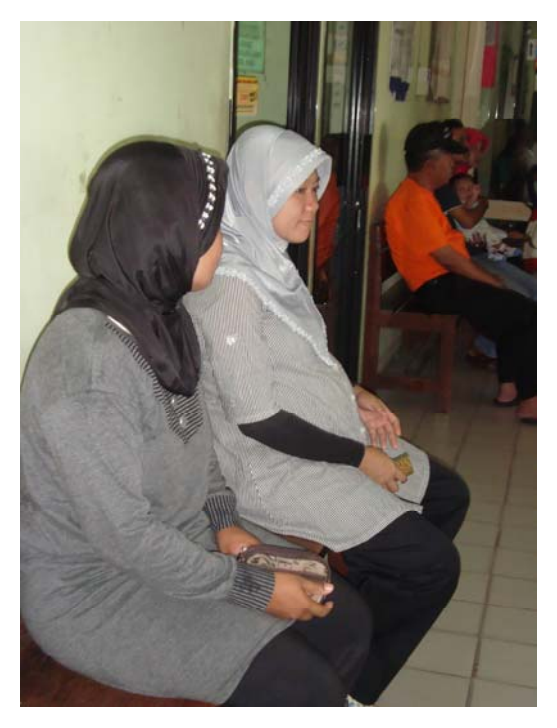
Women at a community health centre, Java.

The right to equality before the law is provided for in the Indonesian Constitution (Article 27.1) and the Human Rights Act (Article 3.2). The right to non-discrimination is also provided for in the Constitution (Article 28.I (2) and the Human Rights Act (Article 3.3).