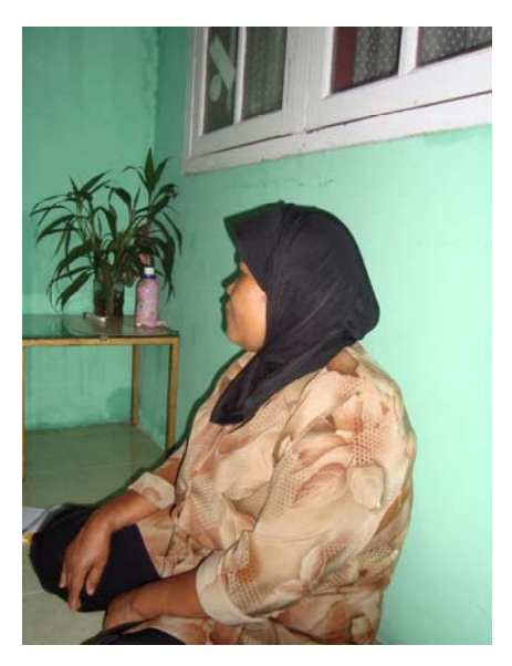
A 50 year old mother of four from Java. She was married at age 13 and had her first child at age 14 © Al

Although the status of women in Indonesia has changed in recent decades, especially with the increase in women's participation in the formal workforce, their role and status are still perceived mainly in relation to marriage and motherhood. The two aspects – being married and having children – are widely viewed as essential and mutually inclusive in a woman's life: all women should be married and have children, and any woman having a child should be married.