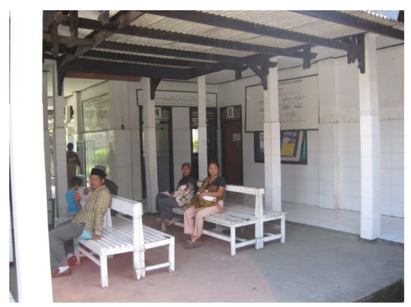
Mother and child waiting in a community health centre, Eastern Indonesia.

Further, CEDAW requires states parties to "ensure to women appropriate services in connection with pregnancy, confinement and the post-natal period, granting free services where necessary, as well as adequate nutrition during pregnancy and lactation" (Article 12.2).