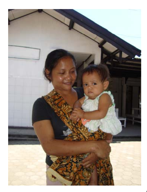
Mother and child at a community health centre, Eastern Indonesia.

With only five more years to go in the MDG timeframe, little progress has been made in the daily realities of women and girls in Indonesia to address these concerns. <sup>167</sup> Certain laws, regulations or mechanisms have been put in place at the local and central levels to address gender discrimination and gender-based violence, <sup>168</sup> and some policies have aimed at disseminating gender-awareness within the administration and among health providers. <sup>169</sup> However, these measures and their impact have been counter-balanced by other pervasive discriminatory practices and attitudes, which are either embedded in laws, regulations and policies, or are part of traditional attitudes or practices which are discriminatory towards women and girls, in particular as regards to sexual and reproductive rights.