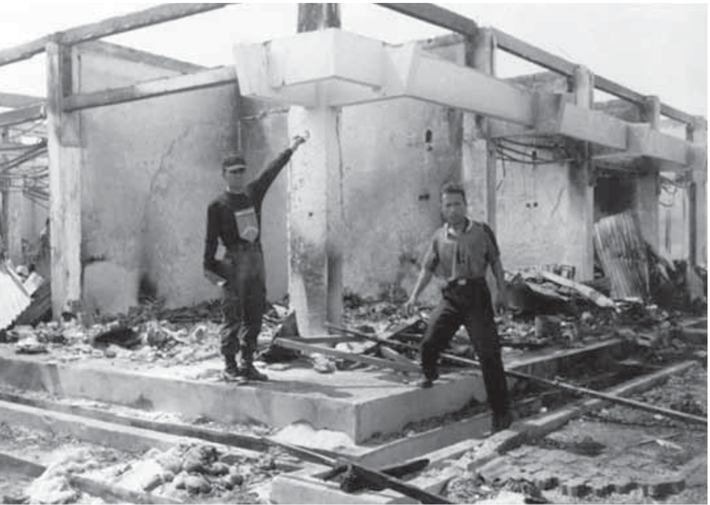
Security officials and residents, rear, survey the charred wreckage of Christian-owned shops torched by Muslim gangs in Poso, December 6, 2001.

from the city. The Kilo Sembilan attack triggered a call to Muslims in surrounding areas to take up arms. It also prompted the Indonesian army to deploy in much larger numbers. 156