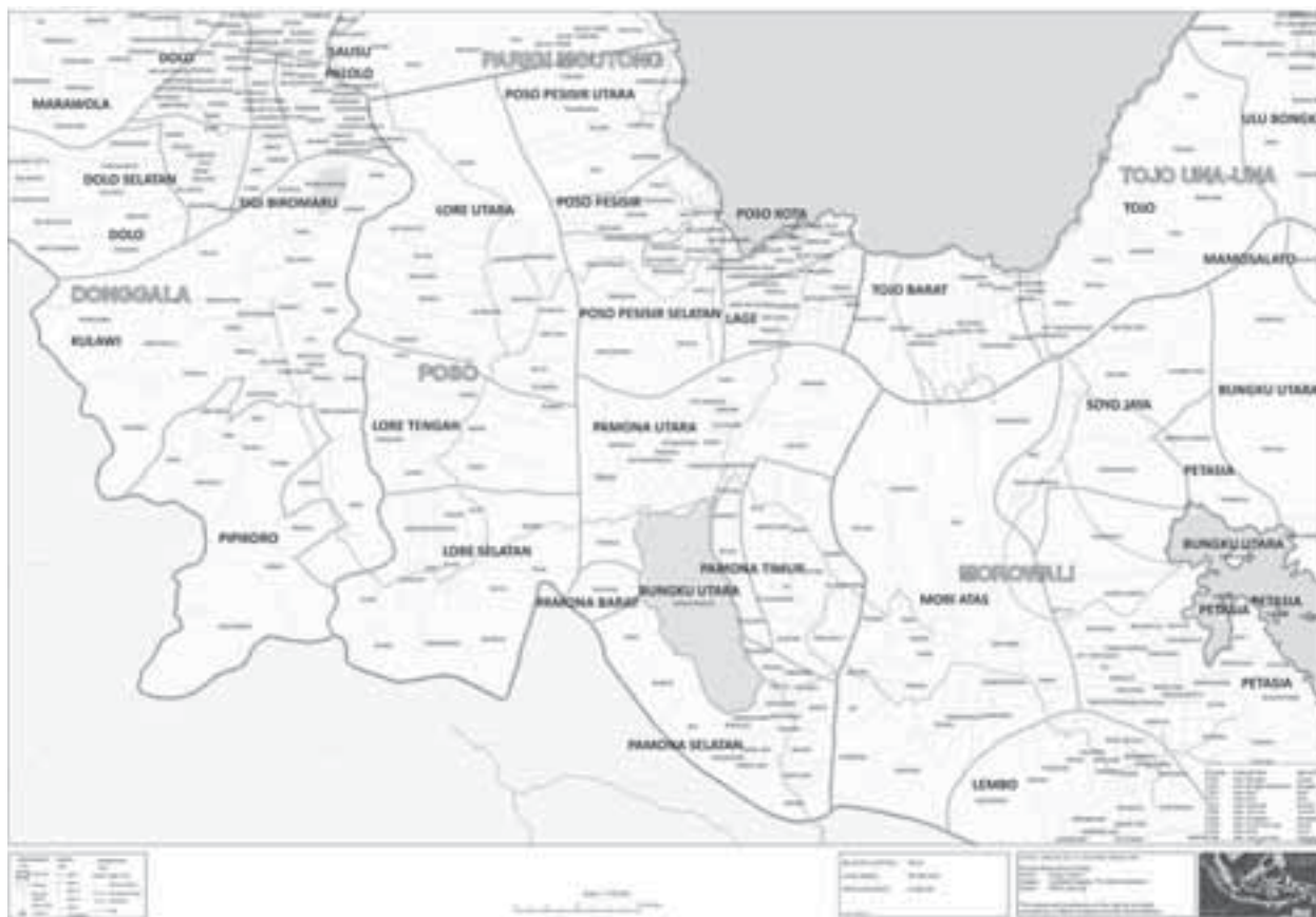
Figure 1: Map of Poso