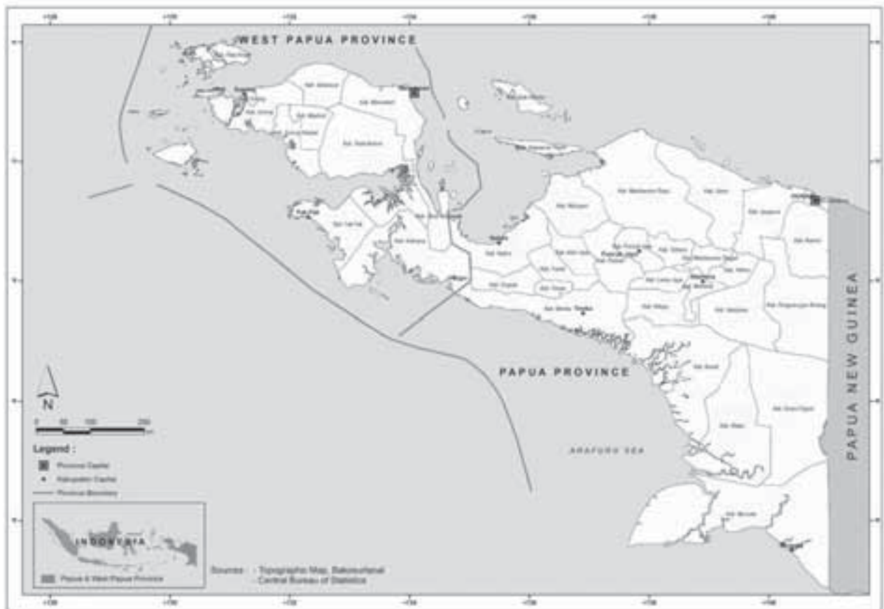
Figure 1: Map of Papua