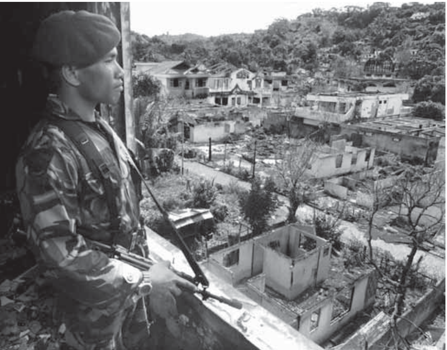
An Indonesian soldier stands guard above a village destroyed by fighting between Muslims and Christians in Ambon, January 14, 2000.

killed by Christians. Those attacks were in turn used to call on Christians and Muslims to engage in further violent conflict, which the military could do little to contain.