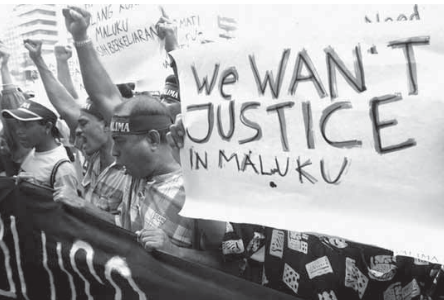
Ambonese demand the UN intervene in renewed fighting between Christians and Muslims in Jakarta, May 22, 2000.

local NGOs and ran capacity-building programmes to improve local governance. Efforts were made to try and provide an incentive for religious co-operation. For example, the UNDP's Community Recovery Program provided funds to local NGOs on the condition that Christian and Muslim NGOs collaborate. 40 However, local government officials claimed that international organisations did not co-ordinate their activities with them, which led to overlapping assistance in IDP camps. 41