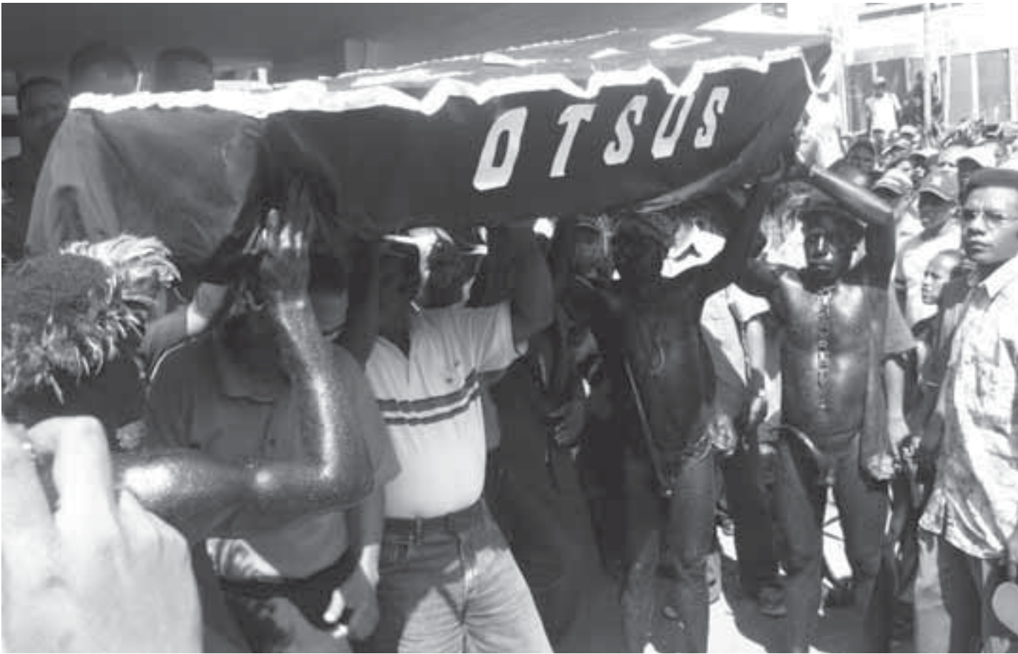
'Otsus is already dead, 2005'. © Muridan S. Widjojo

a third party is not intended to internationalise the conflict but only to help parties build the trust necessary to find a peaceful solution. 108