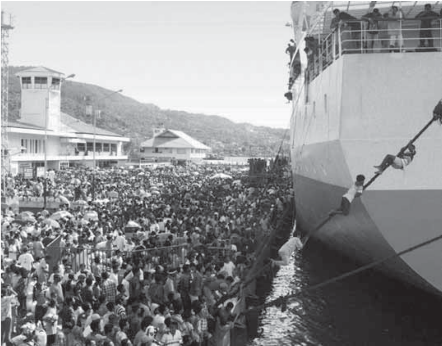
Thousands of migrants and refugees board a passenger ship taking them away from riot torn Ambon, February 28, 1999.

corruption. As one member of the regional parliament put it: