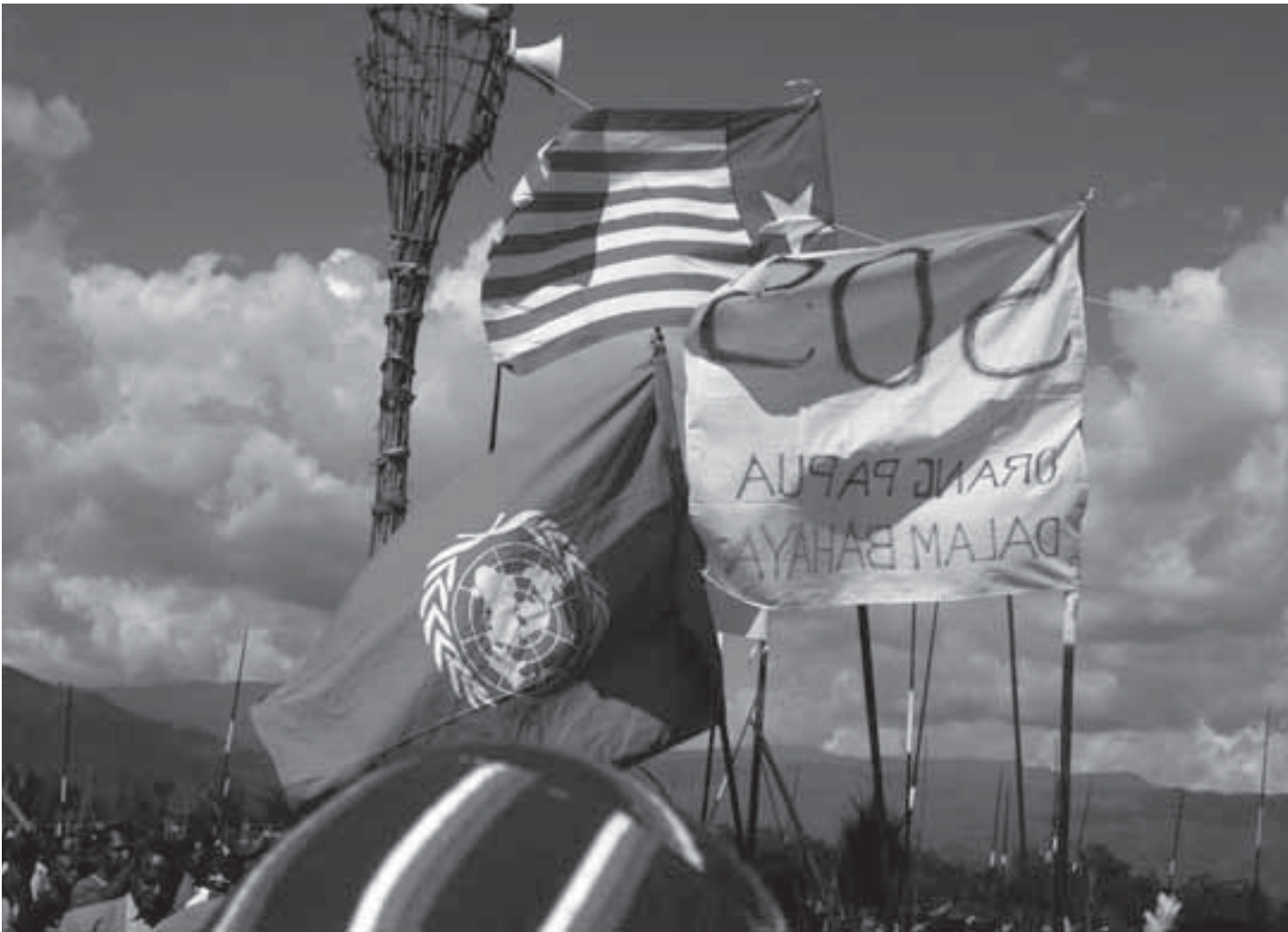
'SOS, Indigenous Papuans in Danger'.

guerrilla operations, the OPM became the main conduit for armed resistance. 70