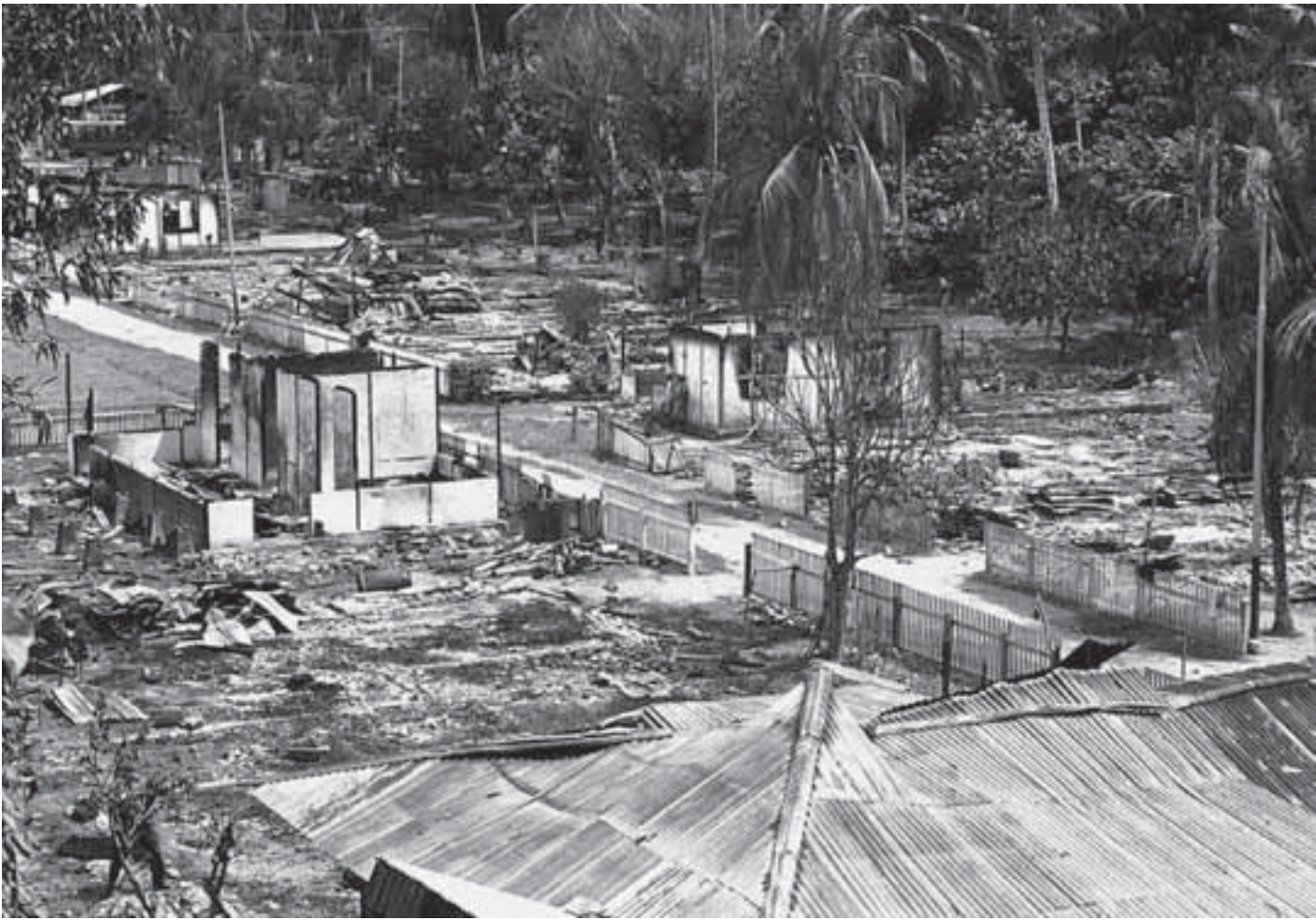
An aerial view of the ruins of a burned village in Poso, 8 December, 2001.

During the Soeharto era, a Pamona phrase, Sintuwu Maroso ('Strong when United' or 'Strong Union') was propagated by the Government as an attempt to bring highlanders and coastal communities together, but had little effect. 159 Poso became increasingly ethnically diverse during the Soeharto era because of voluntary migration from south Sulawesi and government-sponsored transmigration programmes from Java and Bali that began in the early 1950s. The Trans-Sulawesi Highway that connected north and south Sulawesi facilitated migration, particularly those who came voluntarily outside of any transmigransi scheme of the central government. Many people of Bugis origin from south Sulawesi went to Poso in the 1980s because of opportunities offered by the cacao trade. By 1997, just under two-thirds of residents in Poso were