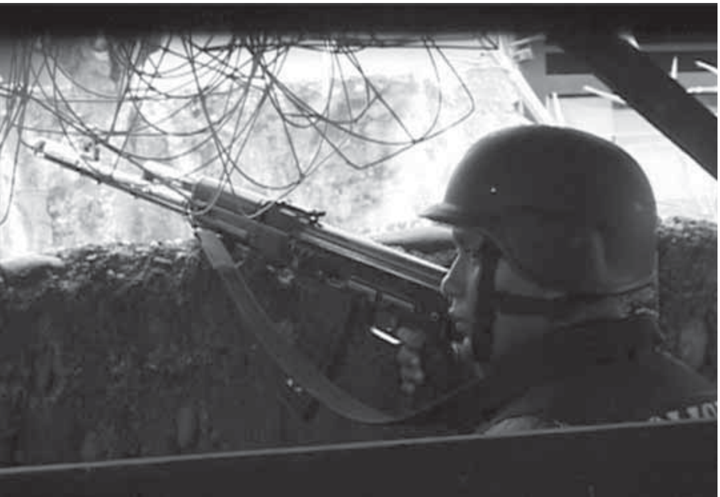
An Indonesian anti-terror squad member takes part in a raid on an Islamic militant stronghold Monday, Jan. 22, 2007 in Poso. The raid set off a three-hour gun battle which left nine suspected fighters and one officer dead, the local police chief said.